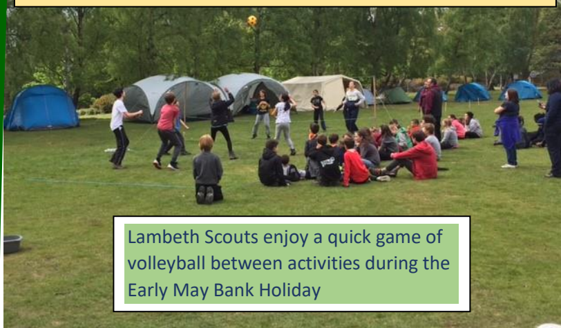
Lambeth Scouts enjoy a quick game of volleyball between activities during the Early May Bank Holiday

Our on-site plumbing has recently been independently inspected, and minor remedial work completed to keep us compliant with legislative requirements.